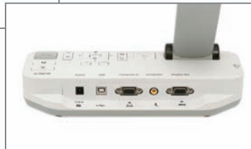
VGA and Composite connection to a projector