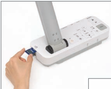
Built-in SD card slot