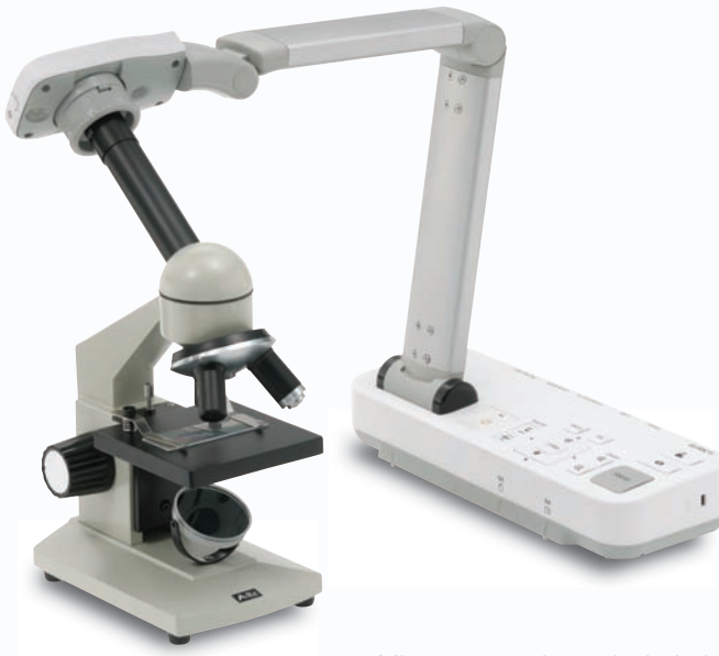
▲ Microscope adapter included (Microscope not included)