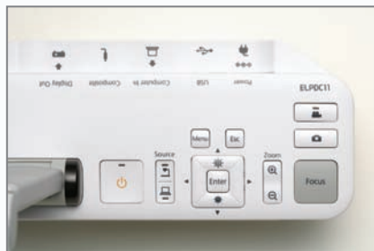
Intuitive buttons and icons